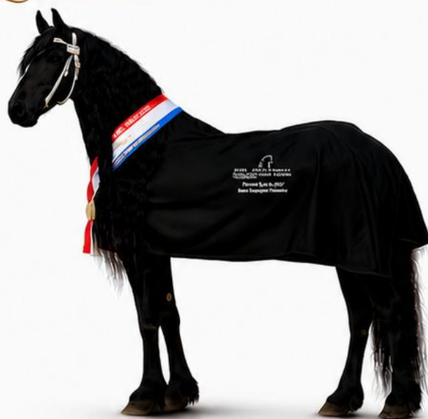
2019 CHAMPION Minke vd Maria Louise Hoeve